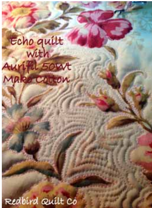
Another view of the echo quilting...