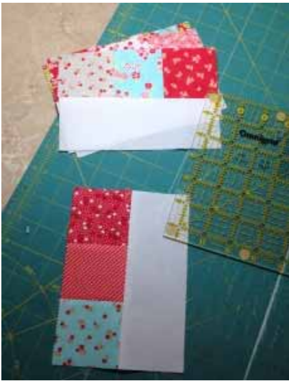
four patches: 4.5" square